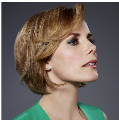
DARCEY BUSSELL PRESIDENT