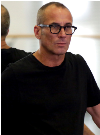
MAURO BIGONZETTI

Candidates can choose among the works of the four following internationally-renowned choreographers: