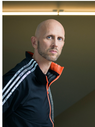
WAYNE MCGREGOR