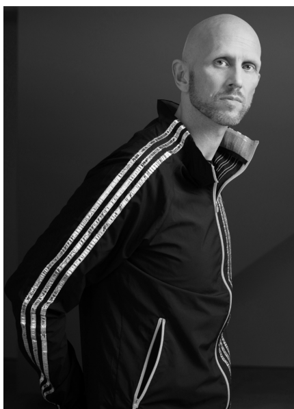
WAYNE MCGREGOR