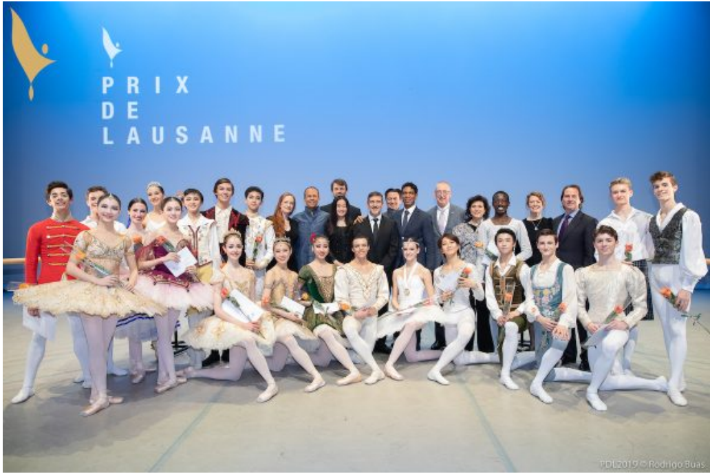
The 21 Finalists