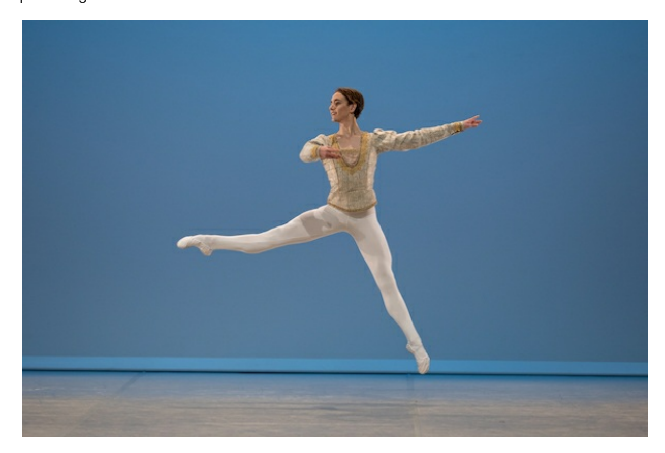
The 21 finalists of the 2018 Prix de Lausanne are:

promising talents who have outdone themselves the most.