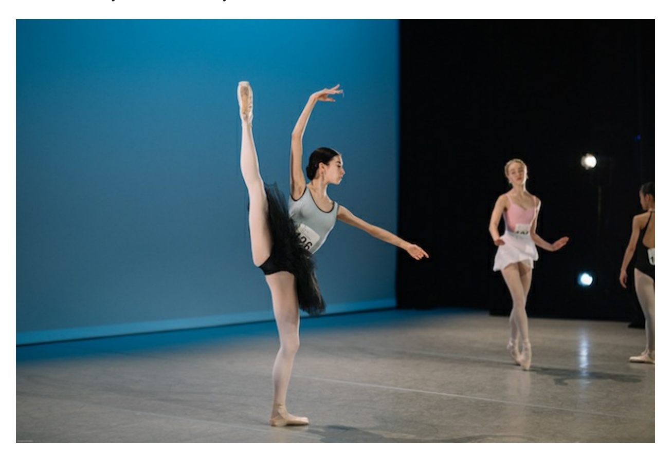
The 21 selected candidates are from 10 different countries and the most represented is the United States with five candidates, and then China with four candidates.

Eight of the finalists will receive one of the scholarships/apprenticeships, for which the Prix de Lausanne is so well known for. The Prize Winners receive the unique opportunity to choose among the most prominent schools and companies of ballet in the world.