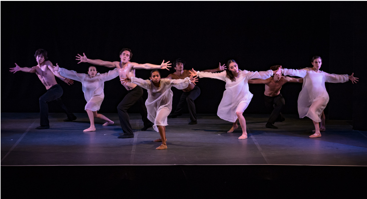
DRESSED UP IN TISSUE PAPER

This year, the Prix de Lausanne is honoured to welcome the National Youth Ballet of Germany (PICT. 1), and two internationally recognized soloists from the Royal Ballet and the Ballett Zürich (PICT. 2).